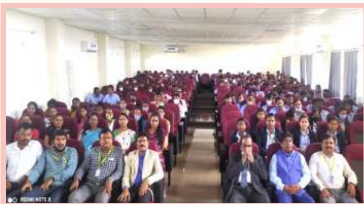
Photograph showing members during the installation new student chapter at BGS Institute of Technology, BG Nagar, Bellur Cross on 17th November 2021(Wednesday).