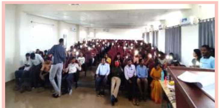
Tribute to Punith Rajkumar